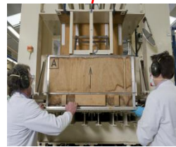
Fibre collection and mattress forming station