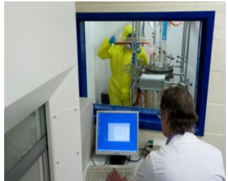
50 Litre jacketed glass reactor